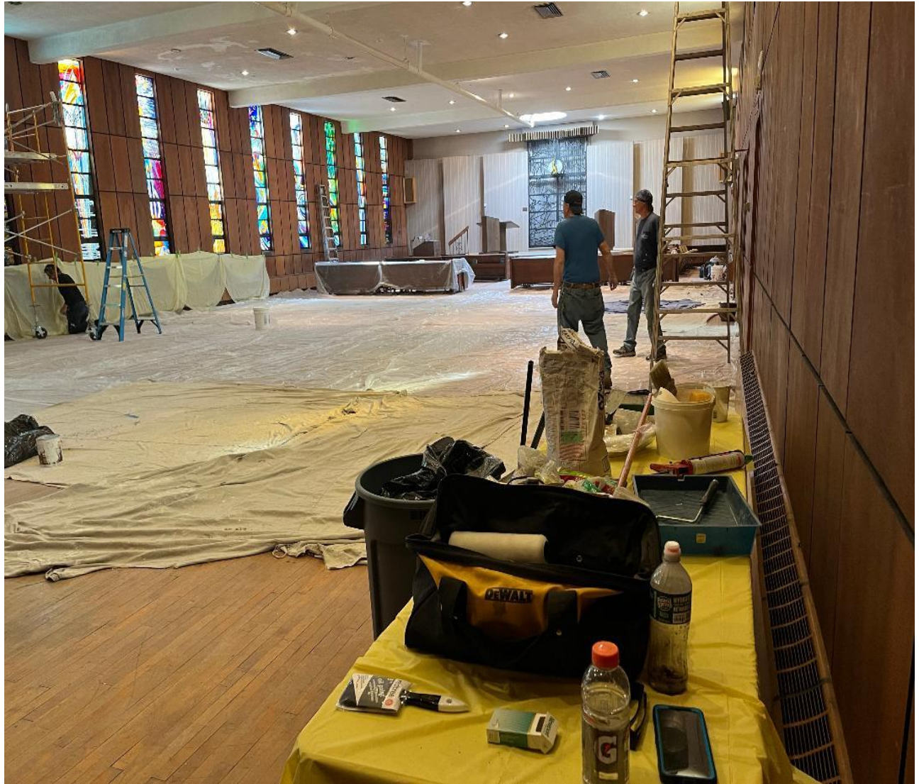
Temple sanctuary in process of being spruced up. Looks great!